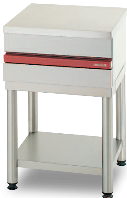
CSA 600 P. Stainless steel worktop.